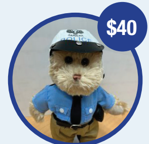
BEAR SPEEDY COP